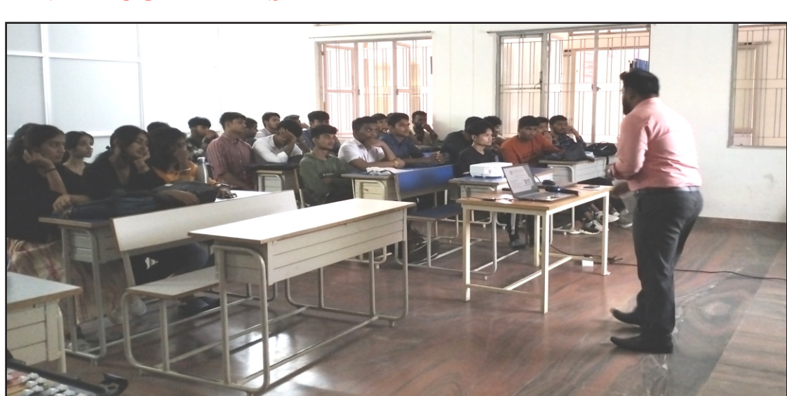
To introduce students to various aspects of college education, a five-day student development programme was organized from 5<sup>th</sup> September onwards by the IQAC. The topics covered under this programme were college life, National Education Policy, outcome of undergraduate programme, various departments of the college, add-on courses and interpersonal skills.