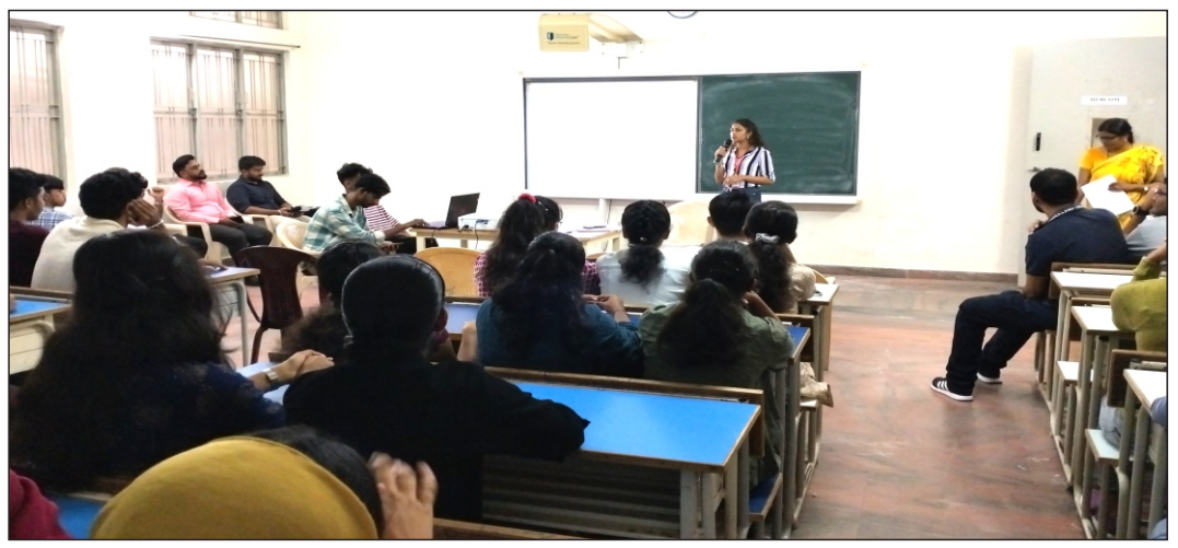
The various clubs of De Paul introduced their nature and activities to the freshers on 15<sup>th</sup> September 2023.