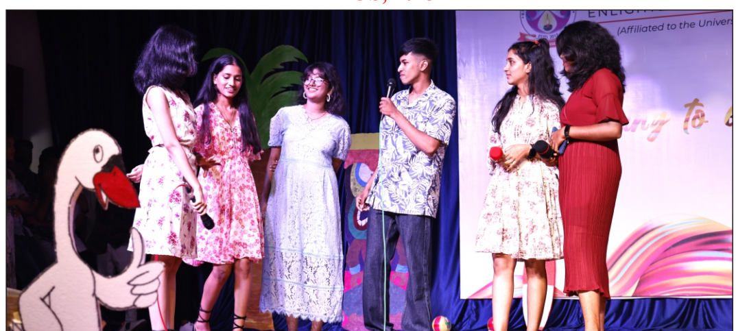
The first year students were given an opportunity to showcase their talents and skills as well as to get to know their classmates better, Freshers' Day, Tyros 2023 was organised on 23<sup>rd</sup> September.