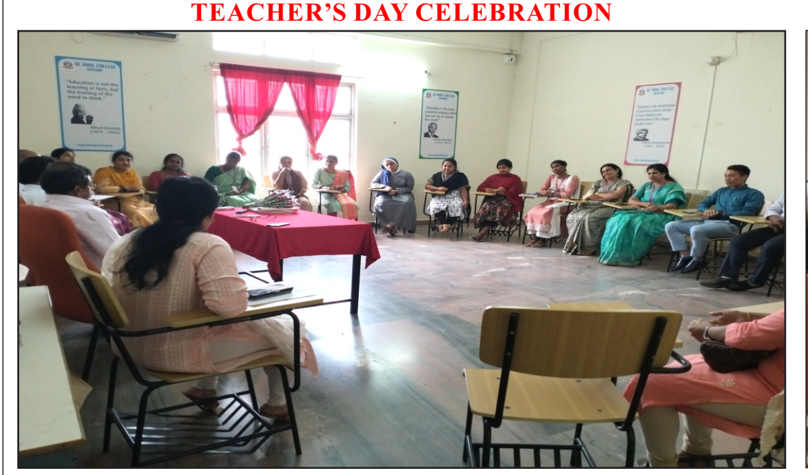
The management organized an informal Teachers' Day celebration on 5<sup>th</sup> September to acknowledge and appreciate the faculty members for their relentless dedication and support towards their profession and the college.