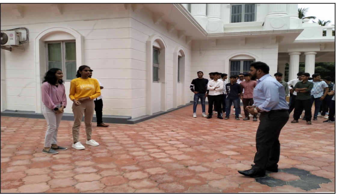
An ice breaking session for the freshers was held on 4<sup>th</sup> September, 2023 to create a comfortable and open learning atmosphere.